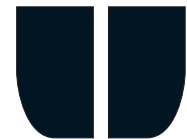
Crescent Shape (Design Reg 412251)